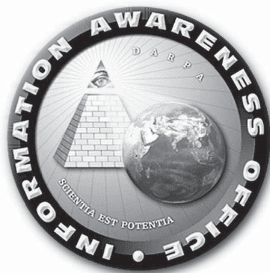
Figure 2. The (defunct) TIA logo

file. According to Poindexter, terrorists can be caught by looking at “patterns of activity that are based on observations from past terrorist attacks.” 3